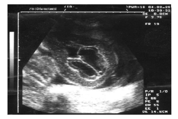
Figure 1: Transverse section through the acardiac twin with the level of the fetal head.

A 27 year-old woman, gravida 4, para 3; was referred to our institution at 23 weeks of gestation because of a twin pregnancy in which one fetus was suspected to be dead. Real-time ultrasound examination demonstrated monochorionic monoamniotic twin pregnancy with a single posterior placenta; twin A was in breech presentation with fetal measurements consistent with 23 weeks. No abnormalities were noted in this twin. Twin B, had no cardiac activity, had a large amorphus mass containing multiple cyctic structures predominantly in the upper portion of the body and generalized edema. There was no evidence of a fetal head structure and of a central cardiac structure. Amniotic fluid volume was increased. (Figure 1) The diagnosis of a fetus acardius acephalus was made. The patient was admitted because of legal termination. Labour was induced by prostoglandin E1 analogs and 12 hours later twins were delivered. The normal twin weighed 600 gr and was a female. APGAR scores at one and five minutes were 1 and 0, respectively.