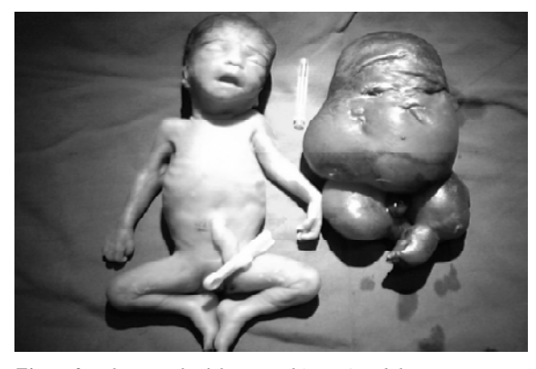
Figure 2: Photograph of the normal (pump) and the recipient twin.

The acardiac twin weighed 680 gr (Figure 2). Upper extremites were absent, the spine and pelvic bones are abnormal; lower limbs were apparent (Figure 3). Eyes were identified, in addition rudimentary ears, mouth and nose were present (Figure 4) and ambiguous genitalia (Figure 5) was observed. Skeleton deformation on X-ray is presented in Figure 6. Autopsy couldn't be done because the family were not give the permission for the autopsy.