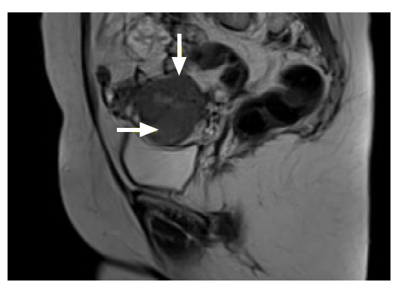
Figure 1: Lobulations in myomterium are shown by arrows.

It was shown that bilateral tuba uterina and ovaries were intact and in lymph node dissection 4 out of 32, which were in left pelvic area, lymphoma infiltration was seen and no atypical cell defined in abdominal wash fluid.