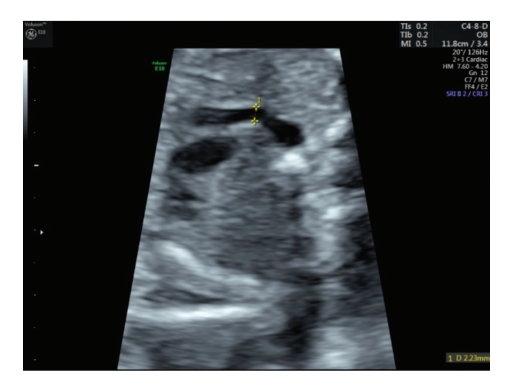
Figure 2. Transverse diameter of ductus arteriosus after resolution of the constriction (Case 1)

days 5 and day 7, respectively. The patient was discharged on tenth day postoperatively. Her antenatal visits were uneventful until delivery. The patient underwent a cesarean section for breech-vertex presentation at 35 weeks' gestation. Male infants weighing 2200 and 2100 g were delivered.