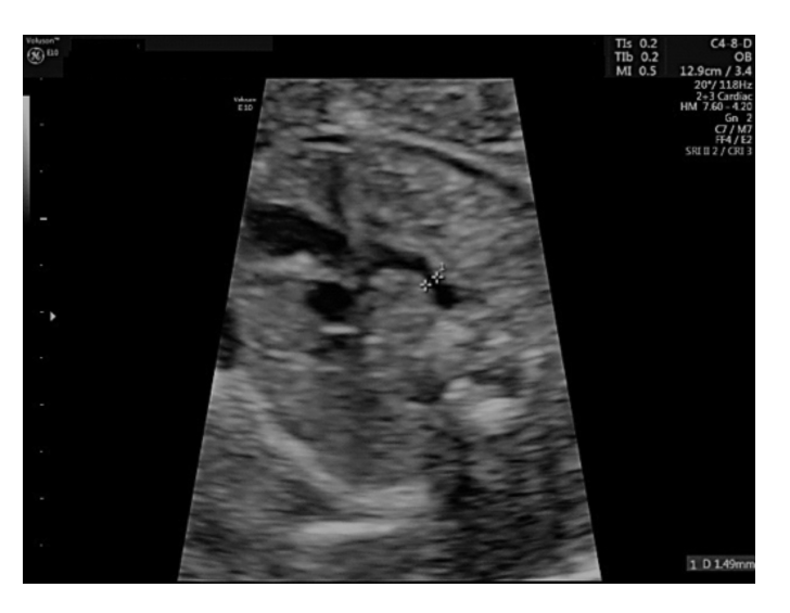
Figure 1. Narrowing in the ductus arteriosus (Case 1)