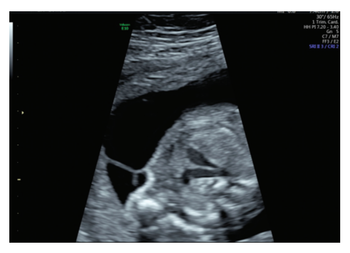
Figure 3. Narrowing in the ductus arteriosus (Case 2)

Preterm delivery is a major cause of perinatal morbidity and mortality. Indomethacin is relatively old and the most commonly used prostaglandin synthetase inhibitor, it has been used in preterm delivery since the 1970s. Maternal use of indomethacin is the most common cause of foetal ductus arteriosus constriction; however, idiopathic constriction of the fetal ductus arteriosus has also been described in the