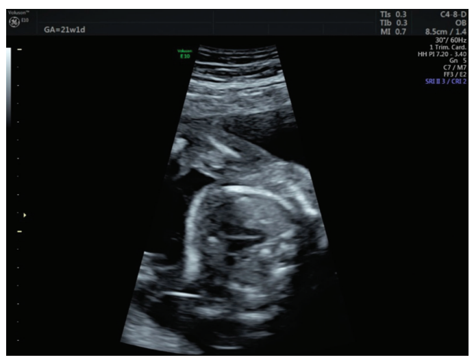
Figure 5 . Transverse diameter of the ductus arteriosus after resolution of the constriction (Case 2)