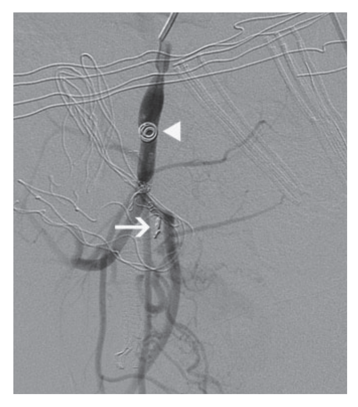
Figure 3. Embolization of the artery supplying the aneurysm with detachable coil (white arrow) and embolization of the internal iliac artery with pushable coil (arrow head)

normally observed. However, it has been reported in patients with uterine fibroids and adenomyosis and those with a history of pelvic surgery, uterine artery ligation or embolization<sup>(16)</sup>. Shin et al.<sup>(2)</sup> detected widespread collateral vessels between the IMA and uterine and ovarian arteries during angiography in a patient with massive PPH who had no history of uterine fibroids, pelvic surgery or embolization. They reported that the hemorrhage was controlled by the selective embolization of the distal branches of the IMA. Kim et al.<sup>(17)</sup> reported a patient with massive PPH due to damage of the collateral network between the superior rectal branch of the IMA and the vaginal artery following vaginal delivery and they controlled the hemorrhage with embolization.