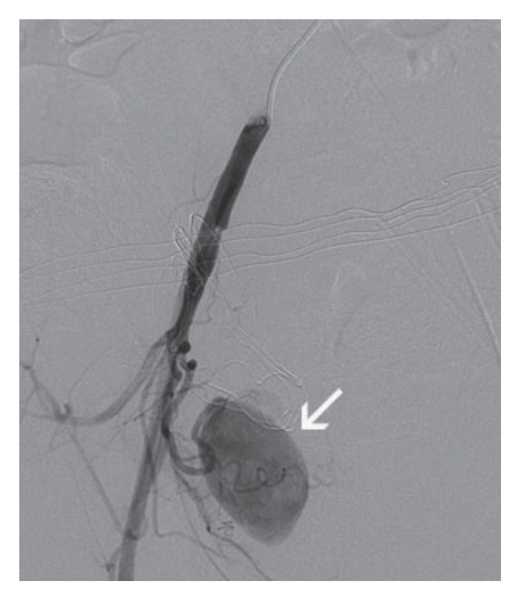
Figure 2. Right internal iliac artery angiography shows aneurysm sac